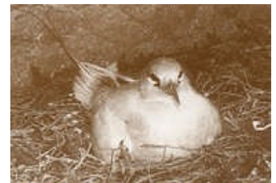
Bosun or Red-Tailed Tropic Bird Phaethon Rubricauda

Other sites on the World Heritage List include the Grand Canyon in the USA, Serengeti in Tanzania and Sagamatha in Nepal (in which Mt Everest is located). The listing also includes the Pyramid Fields of Egypt, Chartres Cathedral in France, and the Convent of Santa Maria della Grazie in Italy where Leonardo da Vinci's 'Last Supper' is painted. At the time of Lord Howe's listing in 1982, only four other island groups in the world had been included on the list, one of these being Charles Darwin's famous, Galapagos Islands.